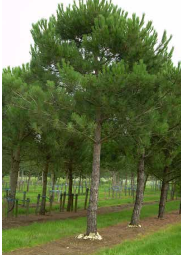
Urban tree glade, including large specimen pine trees with raised crowns